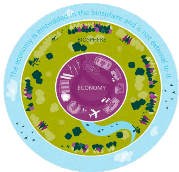
Figure 1. The economy is embedded in the biosphere, not external to it.*

The renowned 2021 Dasgupta Review demonstrated that an economy is embedded in its living ecosystems (see figure 1). Still, too many countries continue to apply familiar approaches that ignore this reality, despite disappointing results. They launch economic development projects here and ecosystem-restoration plans there, in isolation. Their work is fragmented and fails to reflect the powerful interconnections and interdependencies across economic, environmental, and social dimensions that exist at the level of the local landscape, bioregion or territory. By instead embracing such interconnections, leaders can unleash the power to transform such places into engines of renewal that drive sustainable, long-term economic development.